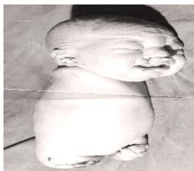
Fig 1: A Case of Tetramelia

has been based on multiple clinical studies of infants exposed to thalidomide which is a potent human teratogen, during the embryonic period. Exposure to this teratogen before day 33 has been seen to cause mild to severe limb defects, such as amelia which is the absence of limbs. It has been seen that most severe limb anomalies occurred from 1950 to 1970 as a result of maternal ingestion of the potent teratogen thalidomide. As a result the drug thalidomide is absolutely contraindicated in women of child-bearing age. Other teratogens effecting limb development are cocaine, ethanol, heroin and chorionic villus sampling. Major limb anomalies appear approximately twice in 1000 newborns. Limb anomalies can vary from simple polydactyly to absence of limbs. Most of these defects are caused by genetic factors. Molecular studies have implicated gene mutation (Hox gene, BMP, Shh, Wnt7, En-1) in some cases of limb defects. There is failure of formation of limb bud. In the partial absence i.e. phocomelia, there is partial development of limb bud. The severe forms can be particularly associated with deformities of cardiovascular system, urogenital system and pulmonary symptoms.