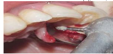
Fig 6: Odontoplasty was carried out for the patient after through debridement (case2).