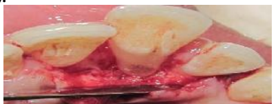
Fig 5: A full thickness mucoperiosteal flap revealing palatoradicular groove extending the full length of root associated with abundance of calculus and bone loss (case 2).