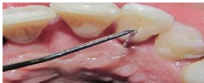
Fig 1: Figure shows palatoradicular groove (PRG) with respect to 22 with 8 mm of periodontal pocket (case 1).

This case report presented the successful treatment of a series of cases with palatoradicular grooves. The key to achieving long-term favorable results in PRG is accurate diagnosis of the problem and eventual elimination of inflammatory irritants and contributory factors. Awareness on the part of clinician about existence of such a peculiarity may help to avoid misdiagnosis and improper treatment of these patients.