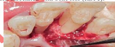
Fig 9: View after through debridement followed by odontoplasty (here 21 can be better appreciated).