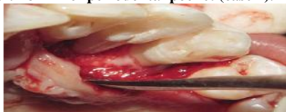
Fig 2: A full thickness mucoperiosteal flap revealing palatoradicular groove extending the full length of root (case 1).