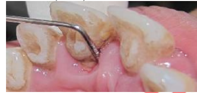
Fig 7: Figure shows palatoradicular groove on 11 associated with probing depth of 7mm in a patient having bilateral PRG (case 3).