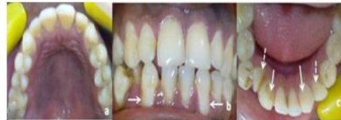
Fig 1: Intra-oral views a) Maxillary arch 2) Frontal view (arrows) showing transposition of canines and c) Mandibular arch showing transposition of canines (arrows) with lateral incisors (dashed arrows).

and harmonize both the arches. The other alternative treatment plan was to move the transposed lateral incisor mesially and canine into its original position. After discussing all the possible treatment options with risks and benefits with the patient. The patient was not willing for any type of treatment procedures. Scaling and oral prophylaxis were performed and he was discharged from the clinic.