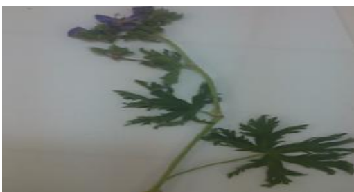
Fig 1: photo of Geranium atlanticum B. et R

According to Quezel and Santa. (1962), Geranium atlanticum B. et R., or “ lbrat er raai ” (figure 1) is a North African endemic species characterised by a red purple intense flowers, rarely white. A cylindrical knotty rhizome. A tall stem with leaves, ramified in general. Spared whitish dense pilosity of pedicels. The bracts inflorescence measure 3 – 5 mm with reddish membranes. This species can be found in mountainous areas of Algeria 4 .